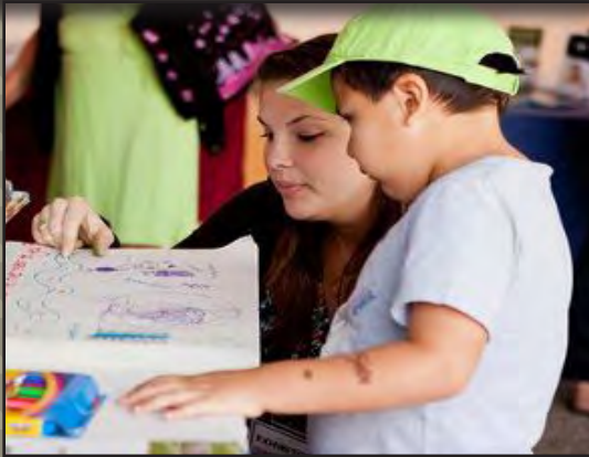
Word on the Street Festival