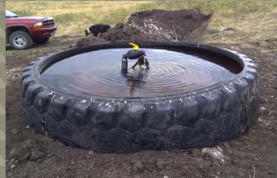
Off stream watering site