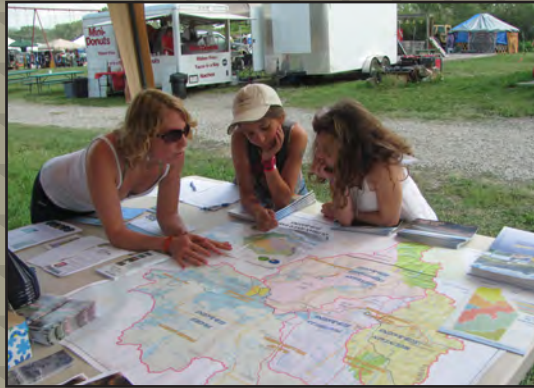
South Country Fair